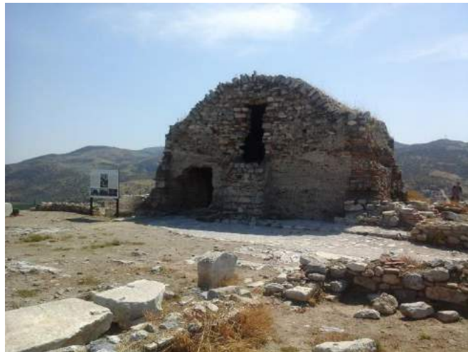
Site of John the Apostle's last refuge on a hilltop above the ancient city of Ephesus. The original building was destroyed during the Ottoman Empire and replaced with this. (MF)

JOHN moves back behind the bench and stands looking out over the heads of those to one side of the gathering.