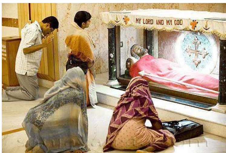
'Tomb of St. Thomas', Basilica of St. Thomas, Chennai, India. Note the quotation above the sarcophagus: an exclamation echoing through time.

Where Thomas taught, the Eastern Catholic tradition lives on to this day: Syriac or St. Thomas (Catholic) Christians, in the state of Kerala alone, numbered 4.25 million at the time of a 2011 census. Later Portuguese Catholic invaders, bent on colonizing southern India, piggy-backed on the work of St. Thomas, trying to wrench it into line with their own agendas; factional battles ensued; but Thomas's work in India was ancient, and has proved resilient. Thomas hadn't needed an invasion. He became compelling because he had miracles he could describe convincingly. How? He'd witnessed them first-hand. The great Senser had heard – seen – touched the proofs of the risen Christ.